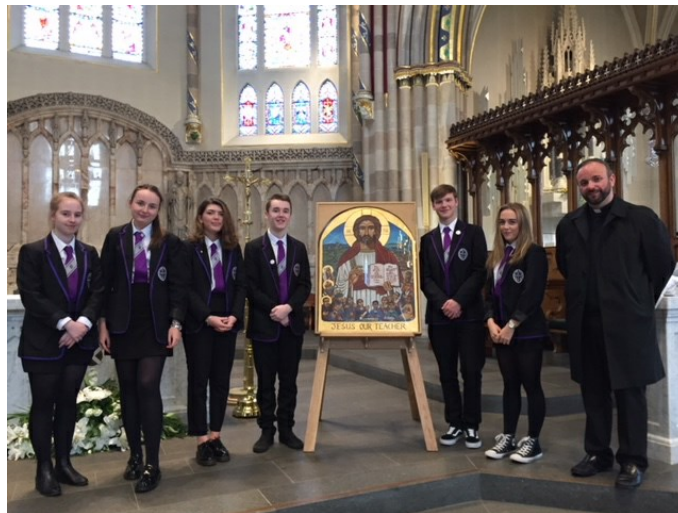
After Mass all the learners were able to spend time exploring the cathedral and in particular taking time with the Icon of Jesus the teacher to mark the 100th Anniversary of Catholic Education.