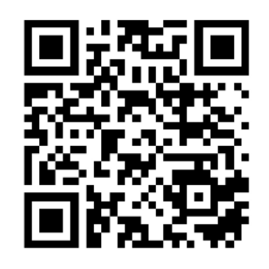
Heres a Qr code for our school news app!