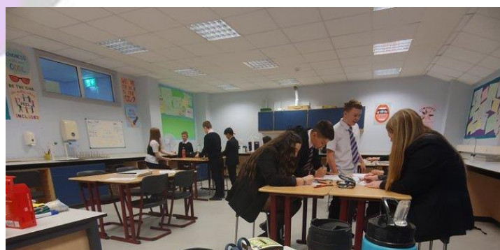
Lots of fun at the S1 Chat and Chill Lunch Club with 15 S1s in attendance. Games of Monopoly and Jenga and arts and crafts.