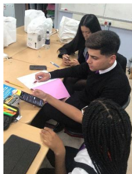
Informal Vocabulary lessons

All of our learners are encouraged to pursue extra-curricular and wider