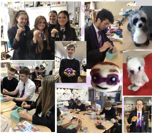
Learning Practical Skills: Needle-felting for Mindfulness ...check out "Felton John" thanks to Olivia!

Our school was built in 2002 at a cost of £11.7 million. We benefit from a state of the art building which supports the delivery of a comprehensive curriculum.