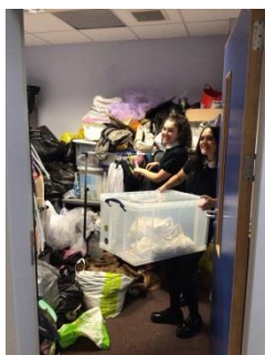
Working with the Drama Department: Scenery, lighting, Front of House, Ghost tours