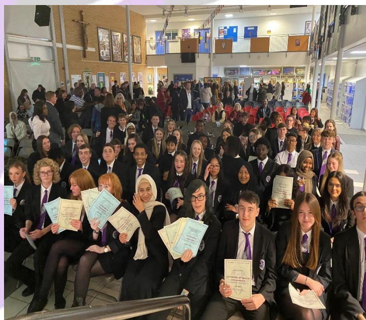
Senior Award Winners 6 October 2022

We are committed to excellent attainment and to ensuring that our young people achieve their potential.