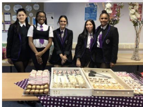
Working late to serve refreshments at All Saints 50 Mass