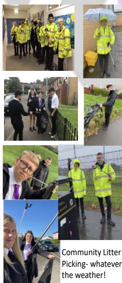
Community Litter Picking- whatever the weather!