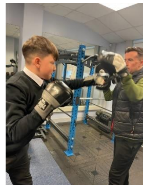
All Saints' Nurture Group