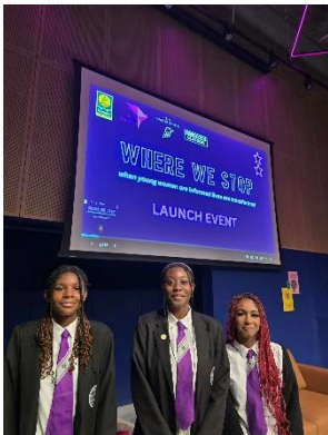
Strong Girls Club! Raising awareness about violence against women.