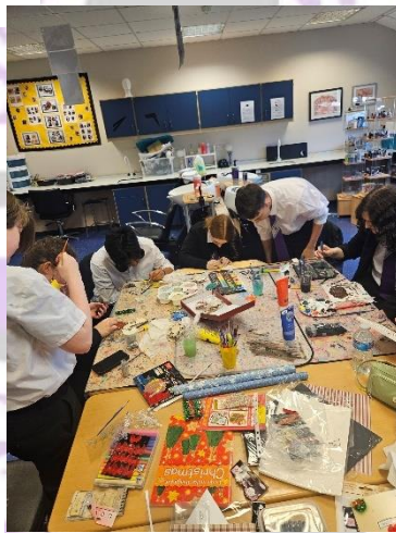
S6 Wellbeing Ambassadors hard at work making Christmas Decorations to be sold at Christmas Fayre.