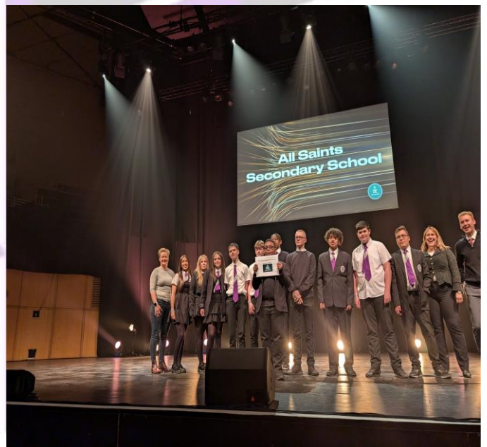
All Saints' Duke of Edinburgh Award Winners collecting their Bronze Award

We are committed to excellent attainment and to ensuring that our young people achieve their potential.