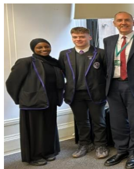
School captains. Super Monday morning meeting!