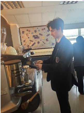
S6 Barista Team

These young people are active in their schools and in parishes showing how "Caritas" is the love of God and neighbour. They are showing love in the support they provide to those in need - younger learners, senior citizens, parishioners, those in other countries whose needs are far greater than their own.