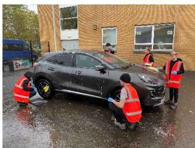
School Car Valeting Training Programme