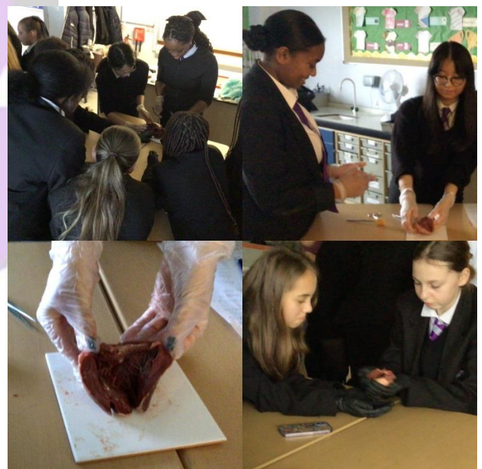
STEM week at All Saints'