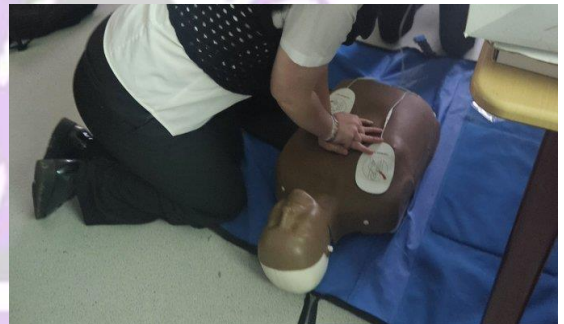
S2 Save a Life CPR Workshop

In our provision of this exciting curriculum we aim to ensure all our young people are well-qualified, skilled and self-confident, able to contribute to their own and the wider community. All Saints' Secondary offers young people opportunities to try new things, develop new skills, experience success and enjoy learning.