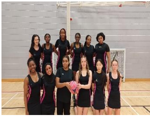
Senior Netball team who has made it through to last 16 of the Scottish Cup.